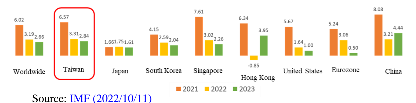
Fig 2: IMF economic growth forecasts for major economies (2021 to 2023)